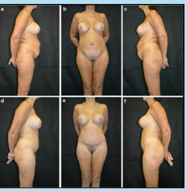
A 56-year-old patient presented preoperative (a-c) and 6 months postoperative (d-f) views

Seroma formation has become the most reported complication after abdominoplasties. In 2000, progressive tension sutures (PTS) were described and reported to be associated with a seroma rate of 0.1%. Surgeons worldwide use PTS to prevent seroma; however, there are discrepancies in the number of PTS commonly used, starting from five up to 35 sutures. The absence of standardization may cause a lack of seroma prevention, increased surgical time, and general hesitation to perform the technique.